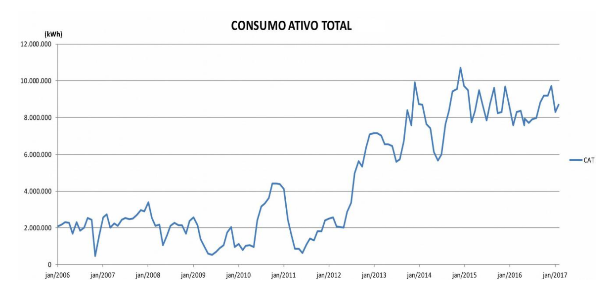
Image 1 - History of the electricity consumption of COGERH over the last 10 years.

The image shows the TOTAL ACTIVE CONSUMPTION (CONSUMO TOTAL ATIVO)